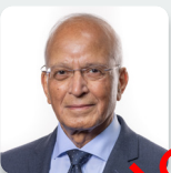
Altaf Hussain MS Welsh Conservatives

The following Member was also a member of the Committee during the scrutiny of the Bill: