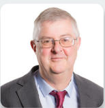
Mark Drakeford MS * Welsh Labour

The following Member was also a member of the Committee during the scrutiny of the Bill: