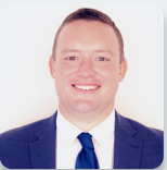
Gareth Davies MS Welsh Conservatives

The following Members attended as substitutes during the scrutiny of the Bill: