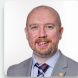
Mabon ap Gwynfor MS Plaid Cymru